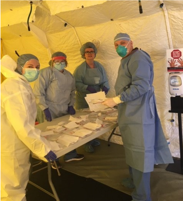
Saint Francis Healthcare's COVID-19 mobile testing team works at their mobile testing tent.

Across the nation and here in Delaware, there is a need for more testing supplies and faster test results.