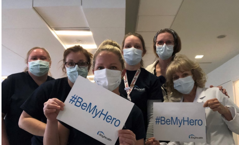
Some of Bayhealth's health care heroes ask Delawareans to #BeMyHero by staying home and practicing social distancing.