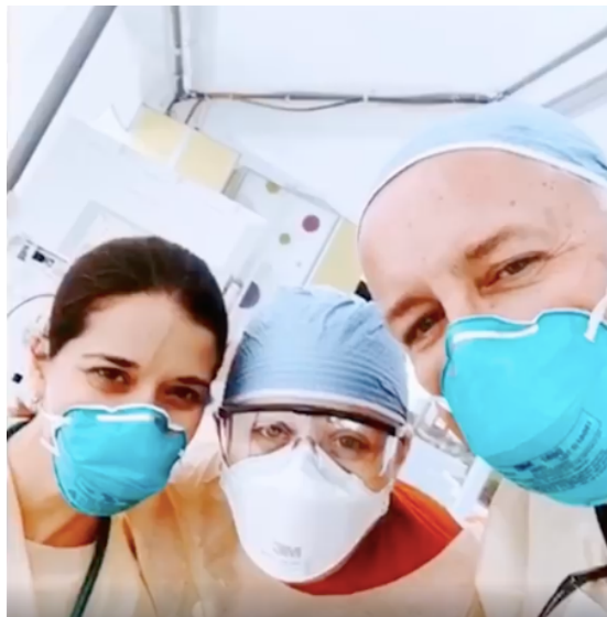
Nemours shared a video on their Facebook page thanking all their #HealthCareHeroes for all they are doing during COVID-19.

Delaware hospital ethics committees, along with the State, are also developing a crisis standard of care framework to be implemented in the event that resources are not available to meet patient need. We hope the COVID-19 situation in Delaware never gets to that point, but our hospitals recognize our duty to plan and prepare for all possibilities.