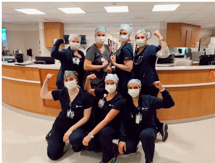
Some of Delaware's health care heroes pose for a picture at ChristianaCare.

We urge state and federal lawmakers to continue finding ways to help hospitals maintain cash flow to support current operations.