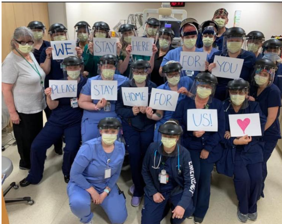
Nanticoke Memorial Hospital's health care heroes call on Delawareans to stay home to slow the spread of COVID-19.