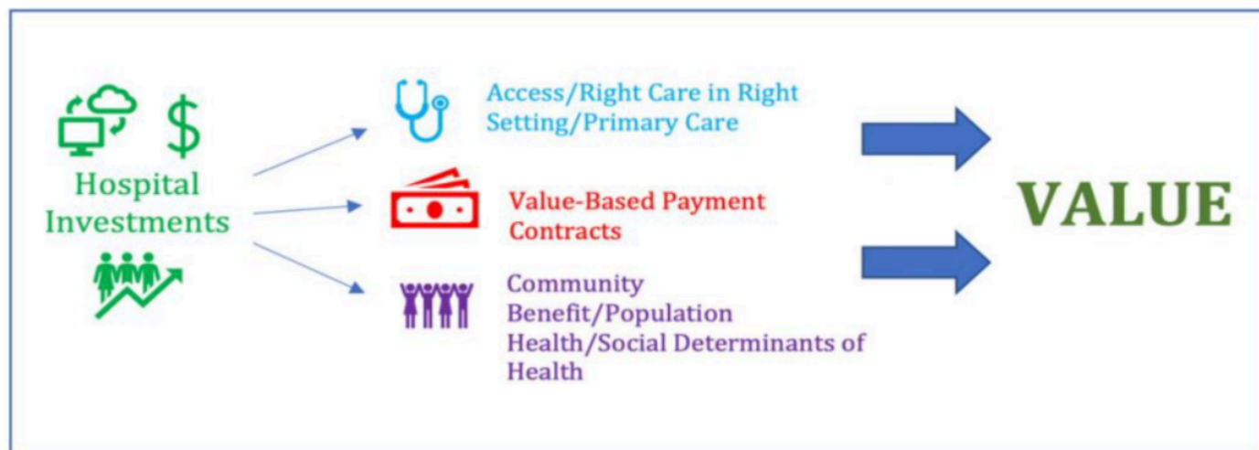
Figure 1. Delaware Hospitals' Investment in Value

To focus their community health improvement efforts, Delaware's hospitals undertake an evaluation process to identify the health needs of their communities. This Community Health Needs Assessment (CHNA) is conducted every three years and also includes an implementation plan containing strategies to help address these needs.